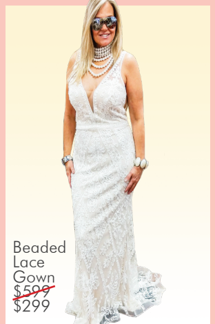
Beaded Lace Gown $599 $299