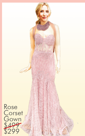
Rose Corset Gown $499 $299