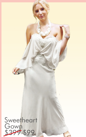
Sweetheart Gown $399 $99